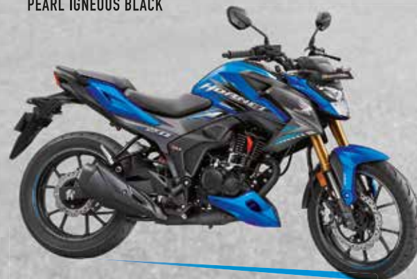
MATTE MARVEL BLUE METALLIC